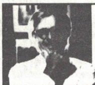
Ray Bradbury is the author of "Fahrenheit 451," "The Martian Chronicles," "The Illustrated Man," "The Beast From 20,000 Fathoms" and many other books.

Nonetheless, the article is generally favorable to libertarians, pointing out the growing appeal of libertarianism, especially among the "baby-boom" generation of business leaders: "There's no question that the appeal of libertarian views is the fastest-growing political phenomenon," says Lee Atwater, 34, a political strategist in the Reagan campaign. "There's a consensus out there that's going to bite people in the ass."